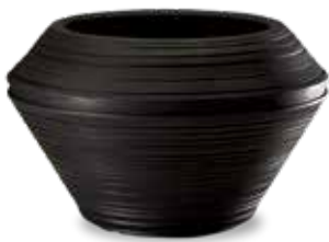
Caviar Black Ref: 94