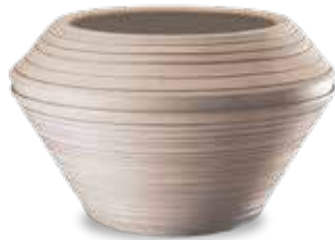
Weathered Stone Ref: 17