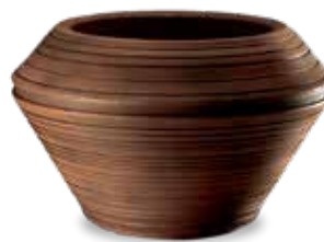
Rust Ref: 33