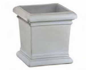
Parchment Ref: 11