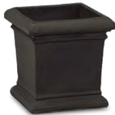
Caviar Black Ref: 94