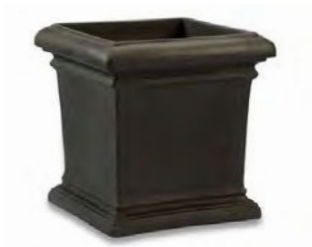
Old Bronze Ref: 14