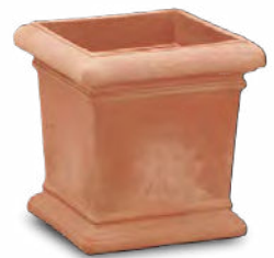
Weathered Terracotta Ref: 34