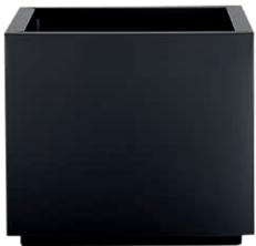
Taupe Ref: 81