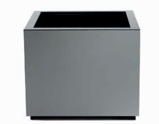
Matte Stainless Ref: 90