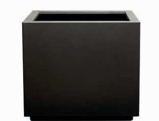
Lead Ref: 92

TREATED STAINLESS STEEL - Great for outdoor use, these planters have been treated to withstand weathering.