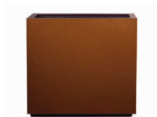
Corten Steel Ref: 33