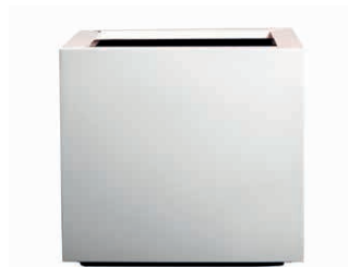
White Ref: 01

TREATED STAINLESS STEEL - Great for outdoor use, these planters have been treated to withstand weathering.