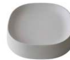
Cloud White Ref: 00