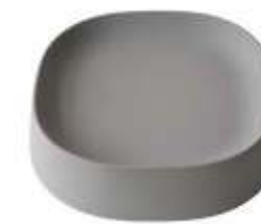
Ash Ref: 98