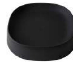
Caviar Black Ref: 94