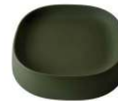
Olive Ref: 82