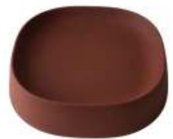
Currant Ref: 47

* 10 Year Limited Warranty for indoor use.