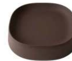
Bark Ref: 74