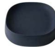
Midnight Ref: 55