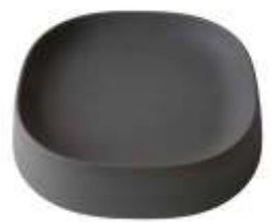
Slate Ref: 97